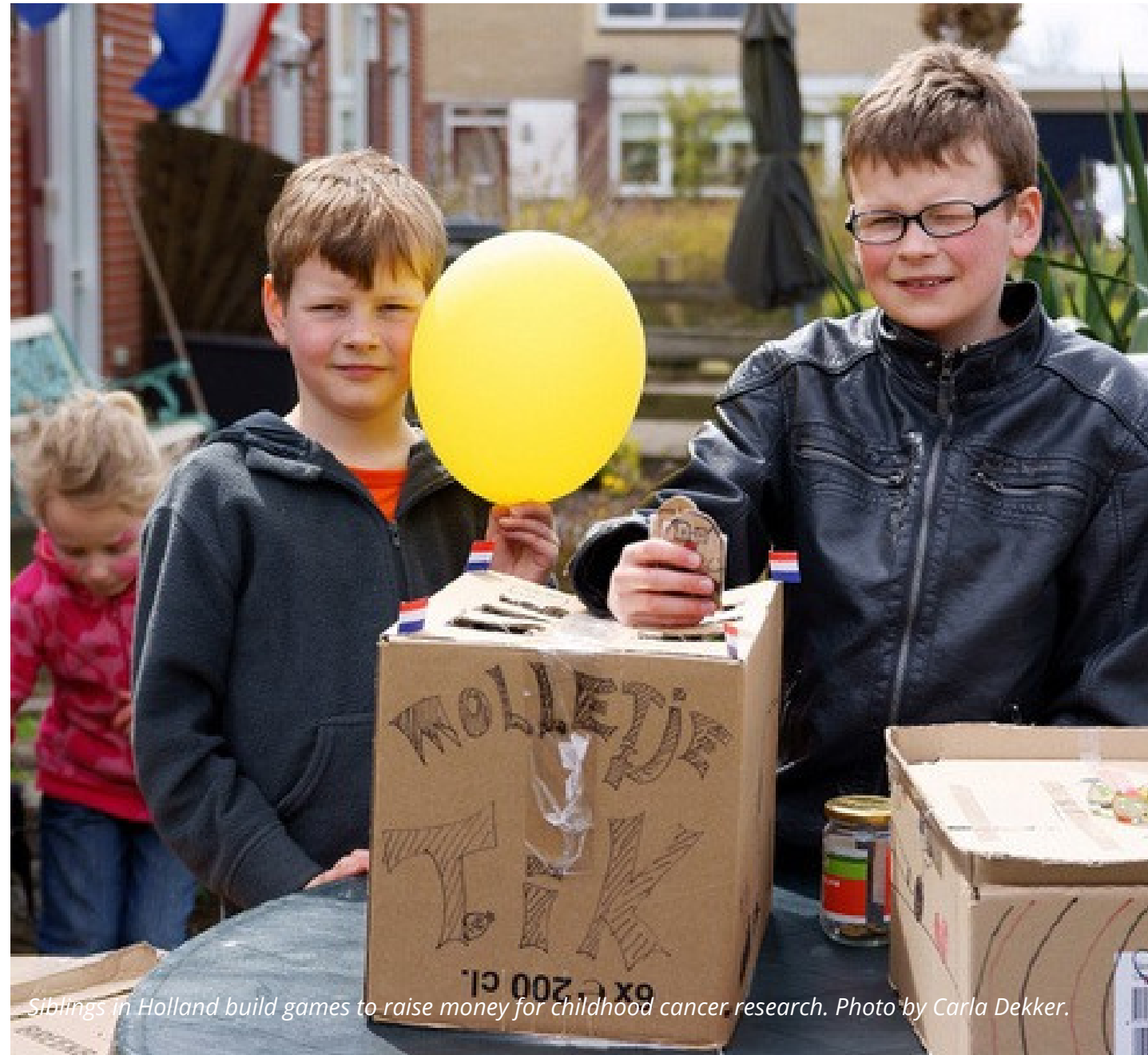
Siblings in Holland build games to raise money for childhood cancer research.