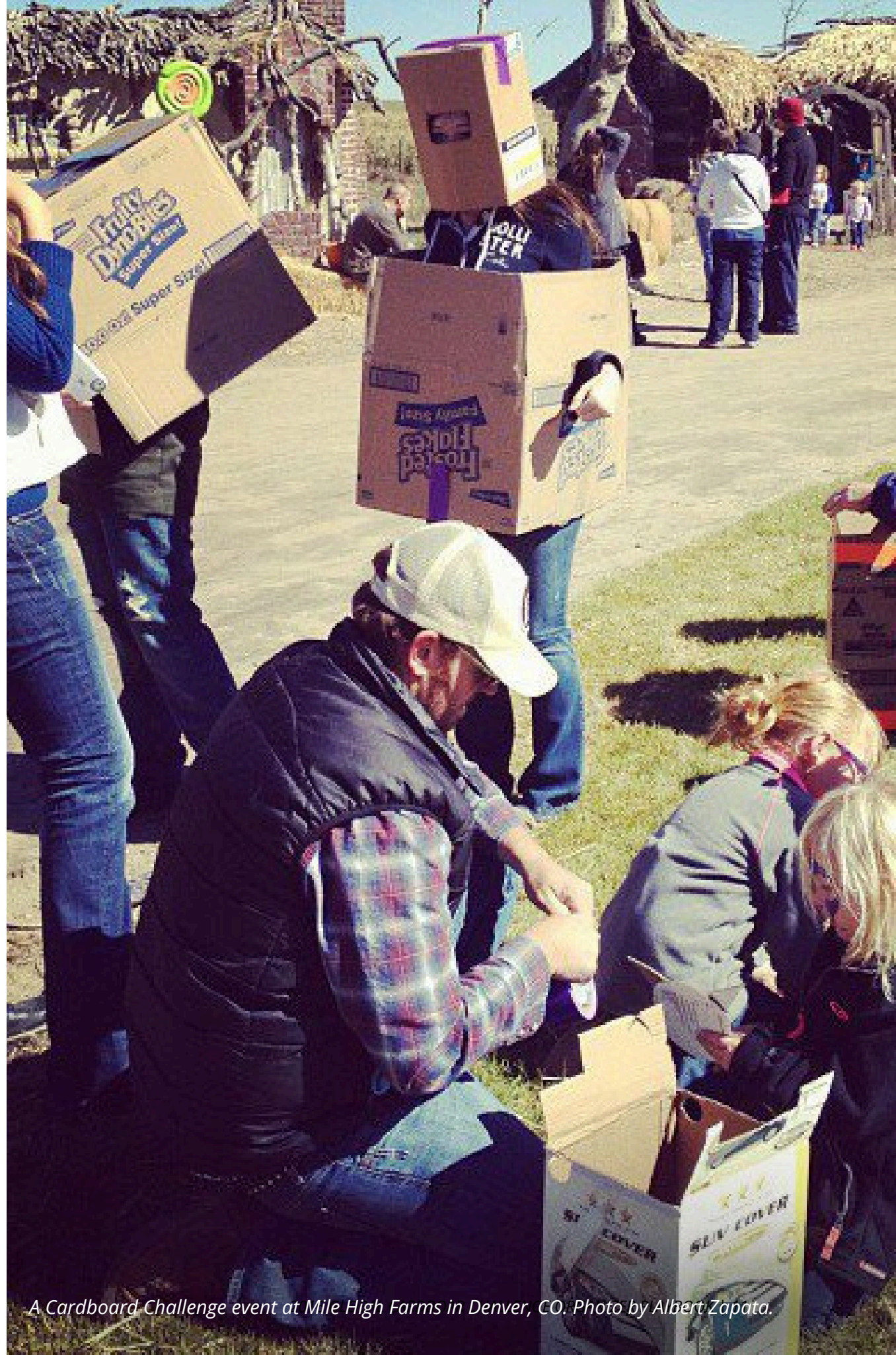
A Cardboard Challenge event at Mile High Farms in Denver, CO.