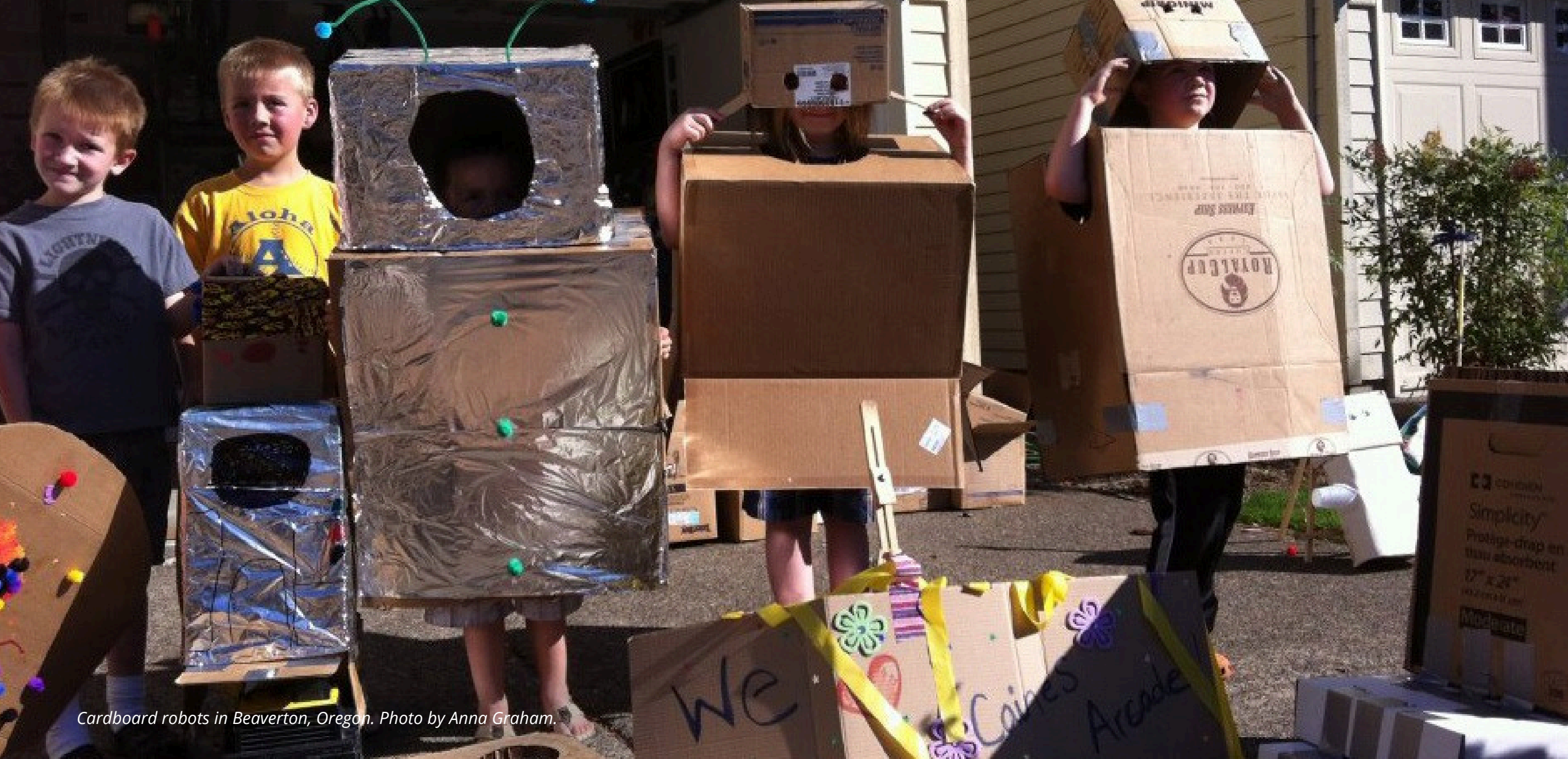
Cardboard robots in Beaverton, Oregon.