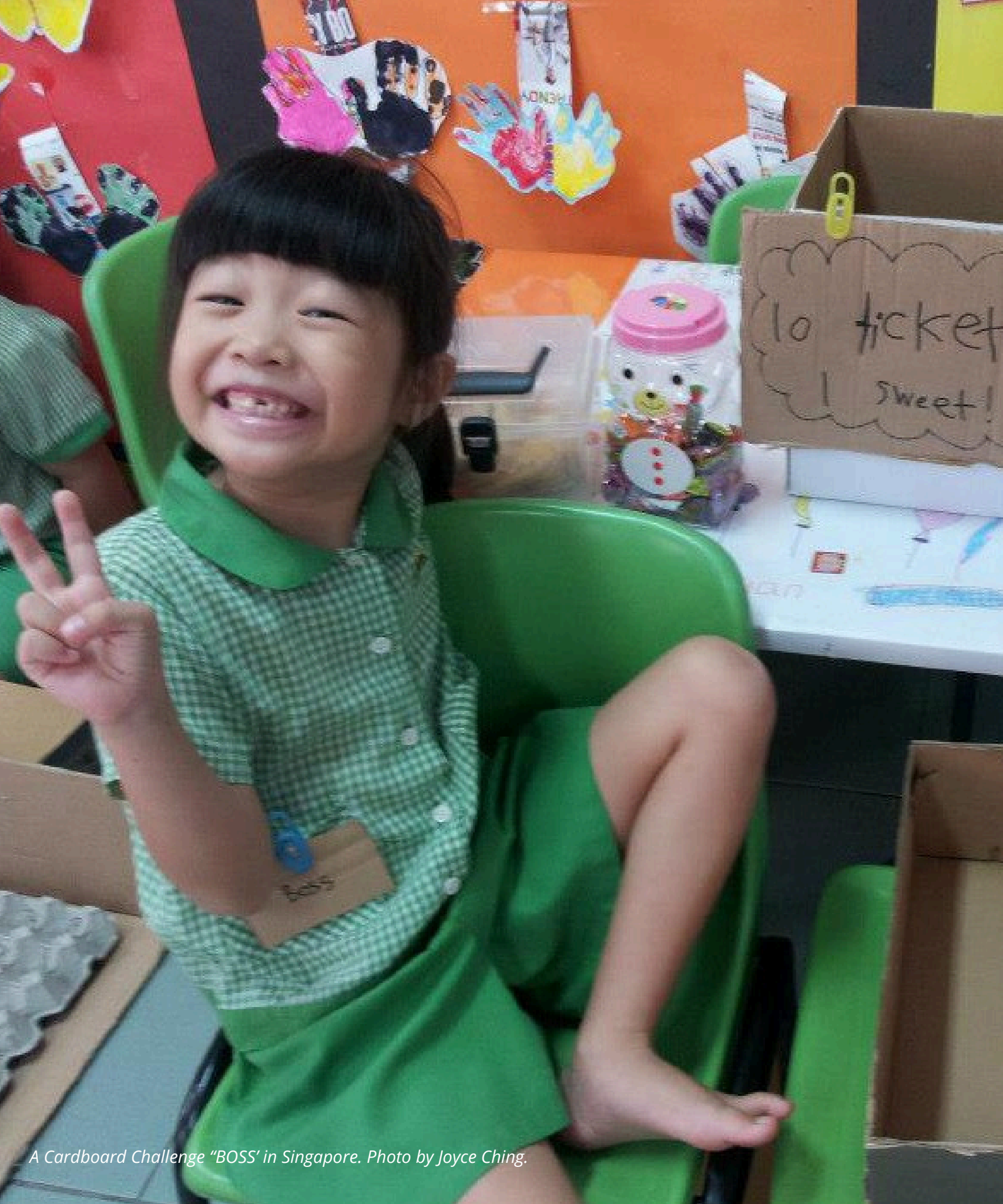
A Cardboard Challenge "BOSS" in Singapore.